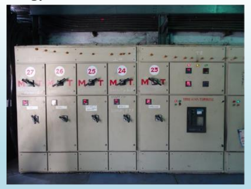
Pollution Control Facility