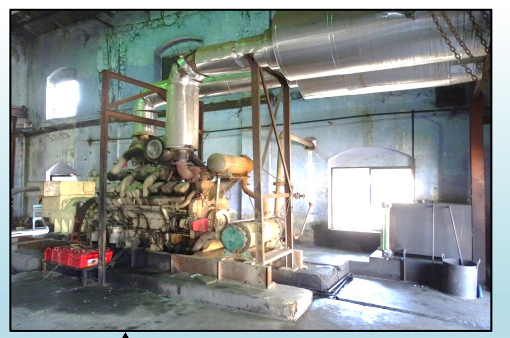
↑1000KVA DG set