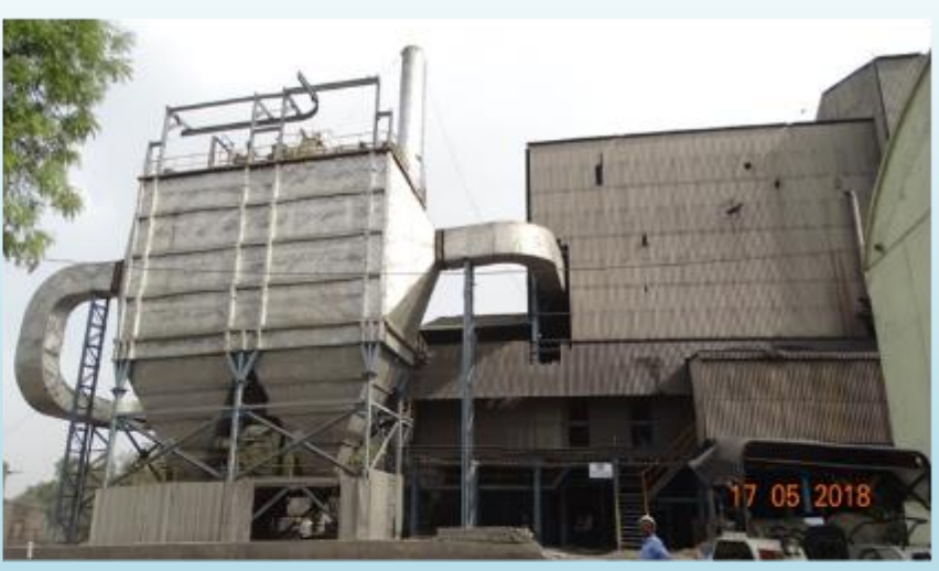
ESP provided for ISGEC Boiler (18TPH)