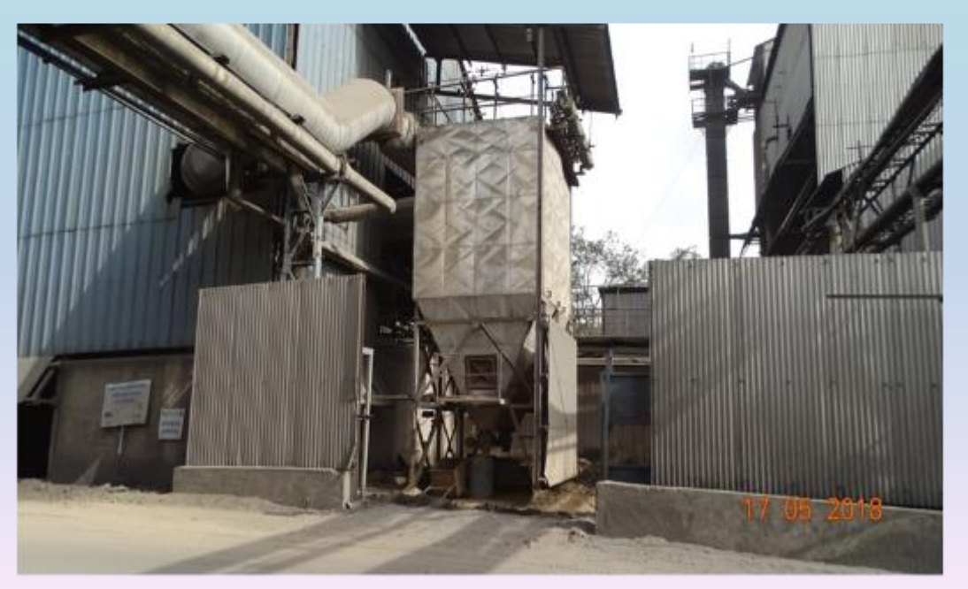
Bag filter for FBC Boiler (12TPH)