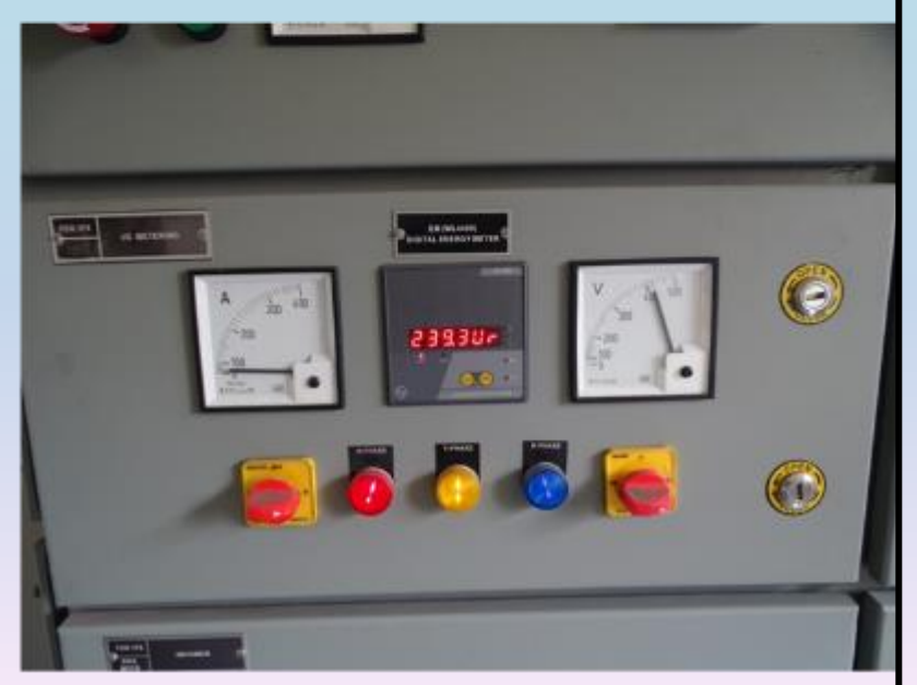
STP MEE plant