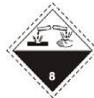
8 – Corrosive