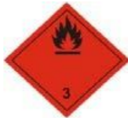
3 - Flammable liquid

UN number : 1862 Proper shipping name and description : Ethyl Crotonate Class : 3 Packaging group : II Reportable Quantity (RQ) : Not applicable Poison Inhalation Hazard : No Hazard labels (DOT) :